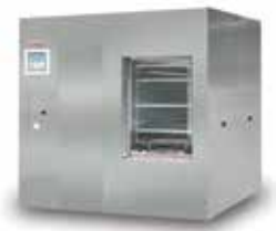
Large Capacity Sterilizers for Medical Use

Featuring Tuttnauer's range of cleaning, disinfection and sterilization solutions