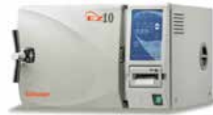
Fully Automatic Table-Top Autoclaves