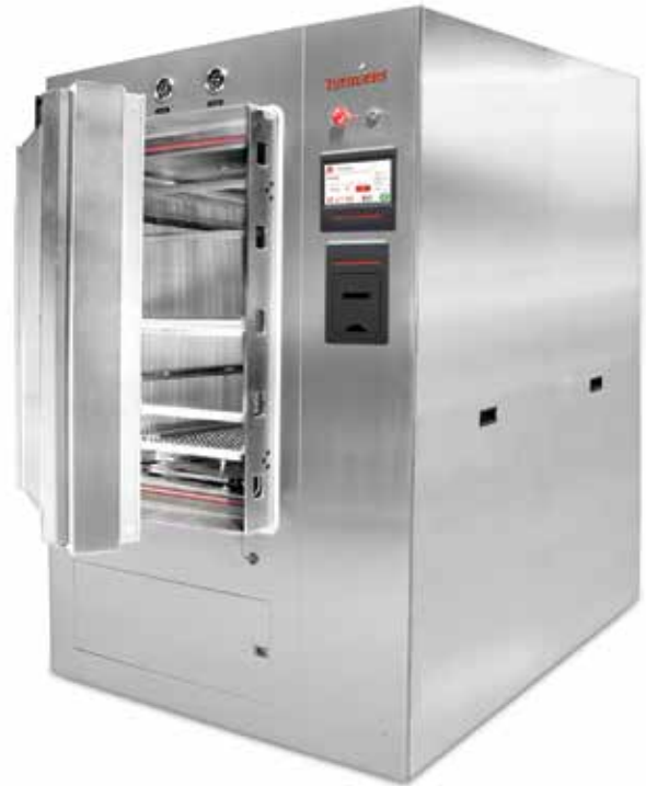
■ Automatic Hinged Door