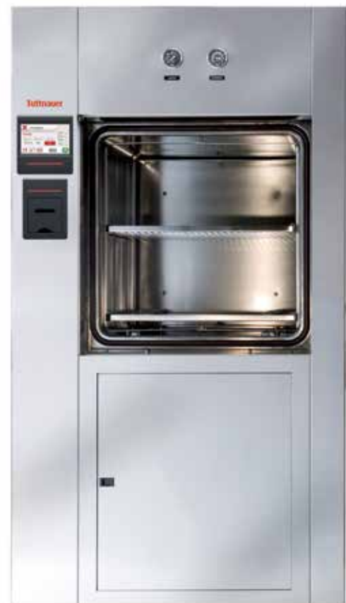
Automatic Hinged Door