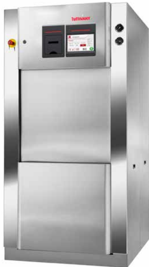
Manual Hinged Door