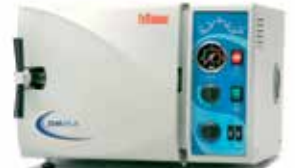
Manual Table-Top Autoclaves

Tuttnauer USA Co. 25 Power Drive, Hauppauge, NY 11788 Tel: +800 624 5836, +631 737 4850 Fax: +631 737 1034 E-mail: info@tuttnauerUSA.com www.tuttnauerUSA.com