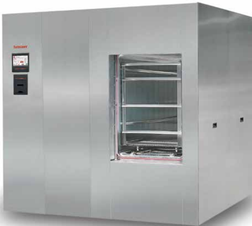
■ Horizontal Sliding Door