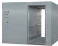
Bulk Sized Sterilizers for Laboratories